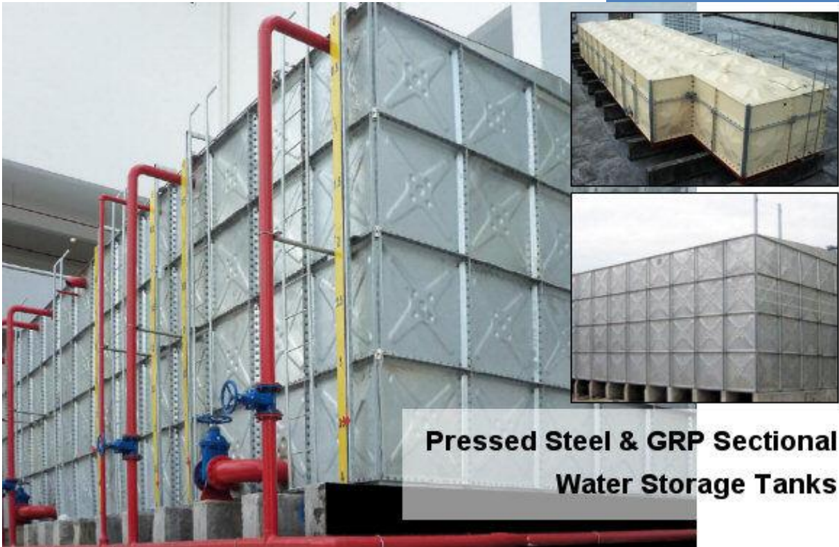
Pressed Steel & GRP Sectional Water Storage Tanks